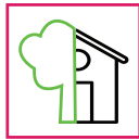
Indoor / Outdoor